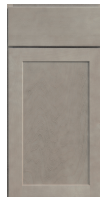
Arbon Alloy Grey