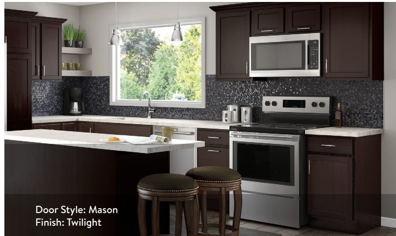
Door Style: Mason Finish: Twilight