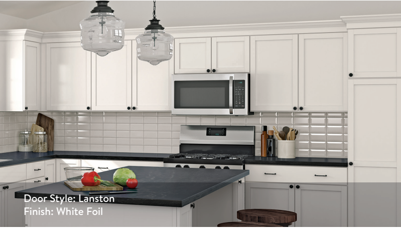
Door Style: Lanston Finish: White Foil