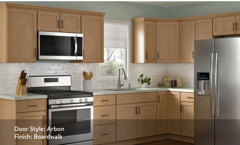
Door Style: Arbon Finish: Boardwalk

Concepts Cabinetry delivers a smart selection of cabinet essentials. Available in-stock and special order in 3 easy steps.