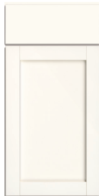
Lanston White Foil