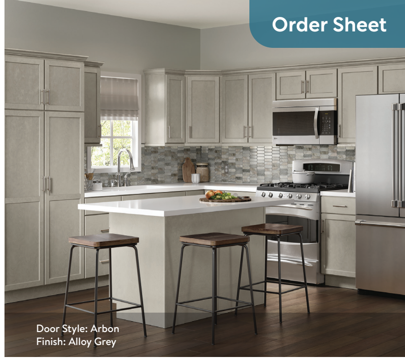
Door Style: Arbon Finish: Alloy Grey

Concepts Cabinetry delivers a smart selection of cabinet essentials. Available in-stock and special order in 3 easy steps.